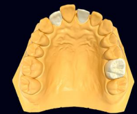
Permanent Crown Resin