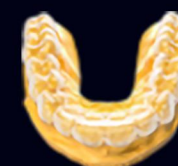
Clear Aligner Resin