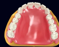
Full Mouth Movable Base Resin