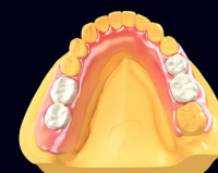
Flexible Base Resin