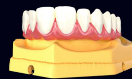
Temp C&B Resin